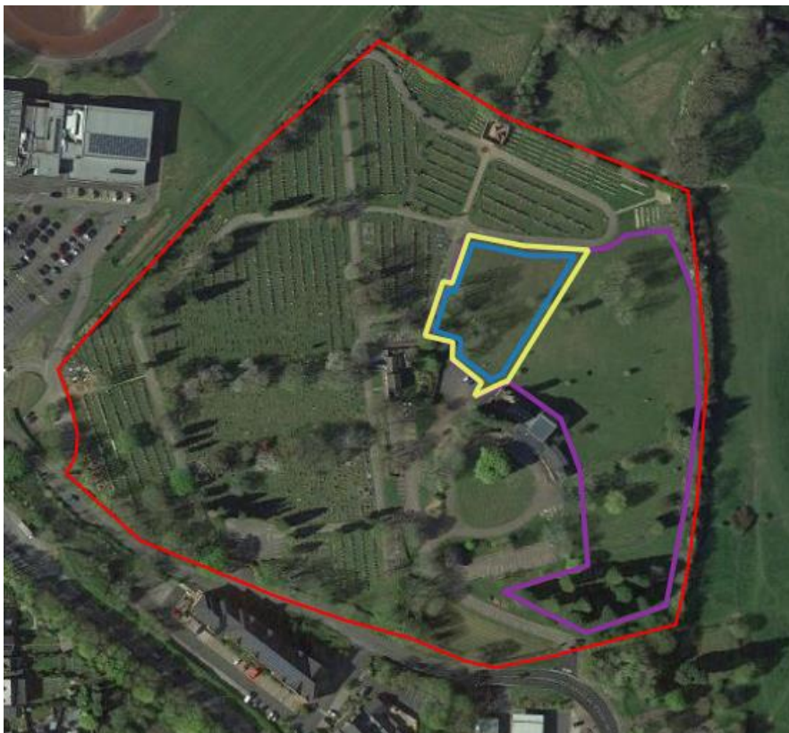
The blue box to the left highlights the ashes scattering area being proposed for reuse as full burial, with the purple area denoting the remaining ashes scattering area.

3.2 Resolution 1 Abbey Cemetery and Redditch Crematorium, B97 6RR, has been proposed by Redditch Borough Council as an option for further burial accommodation. This would be achieved by repurposing existing space designation for ash scattering and using it to accommodate for full body interment .