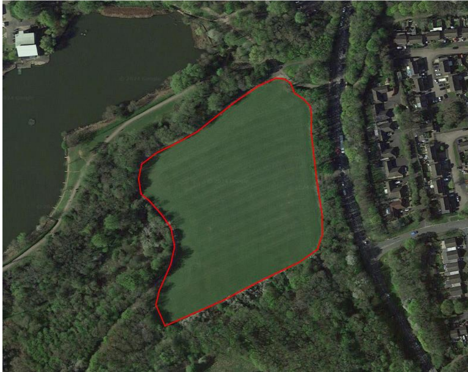
Figure 3. The redline boundary of resolution 2 (Proposed site 2B)

As long as Resolution 1 is granted which will give 10 years additional full earth burials and gives enough time for the council to pursue a new site. As stated, the 2 main immediate concerns around Site 2b are any potential issues with geology & groundwater and from previous cases the potential impact Sport England could have due to the land having been used in the past for sport provision. There is a hope as this was only ever a temporary sport provision that this may not turn out to be a problem, but it is worth tackling it head on in the initial stages of the process.